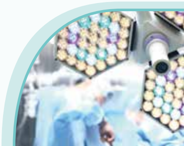
Colorectal Cancer Care Package