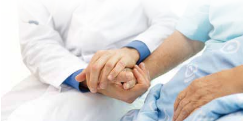
Colorectal Cancer Care Package